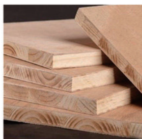
Furniture and wood