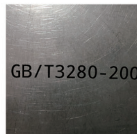
HD bold font