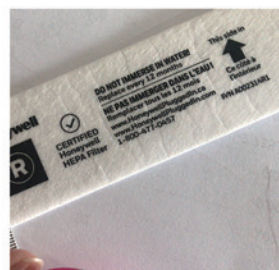
Multi group printing