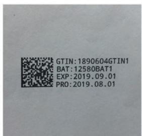
GS1 Data Matrix