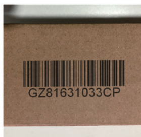
Dynamic security barcode