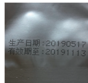
Multi dot font