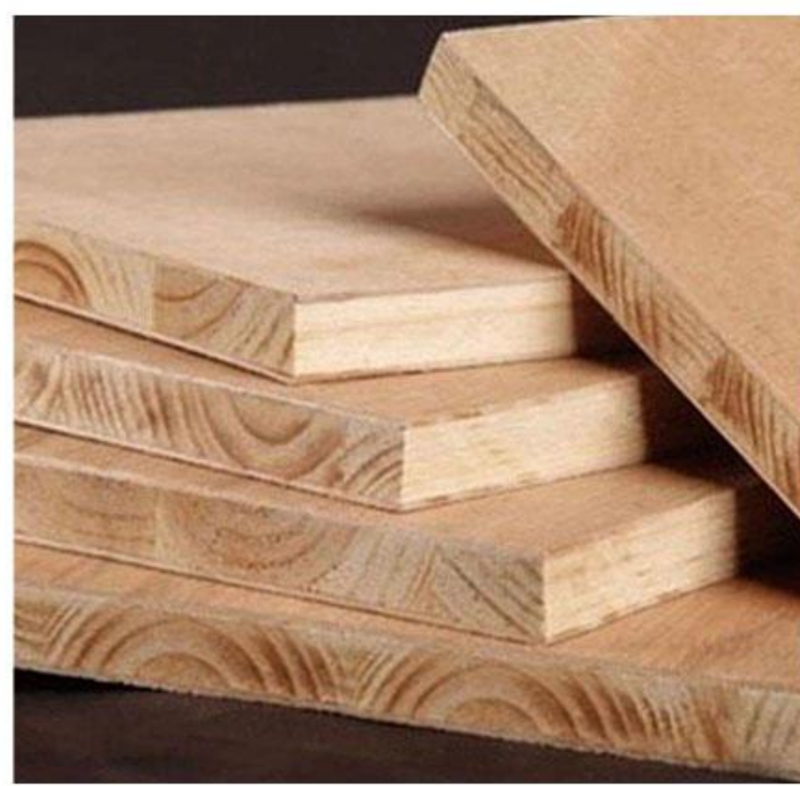
Furniture and wood